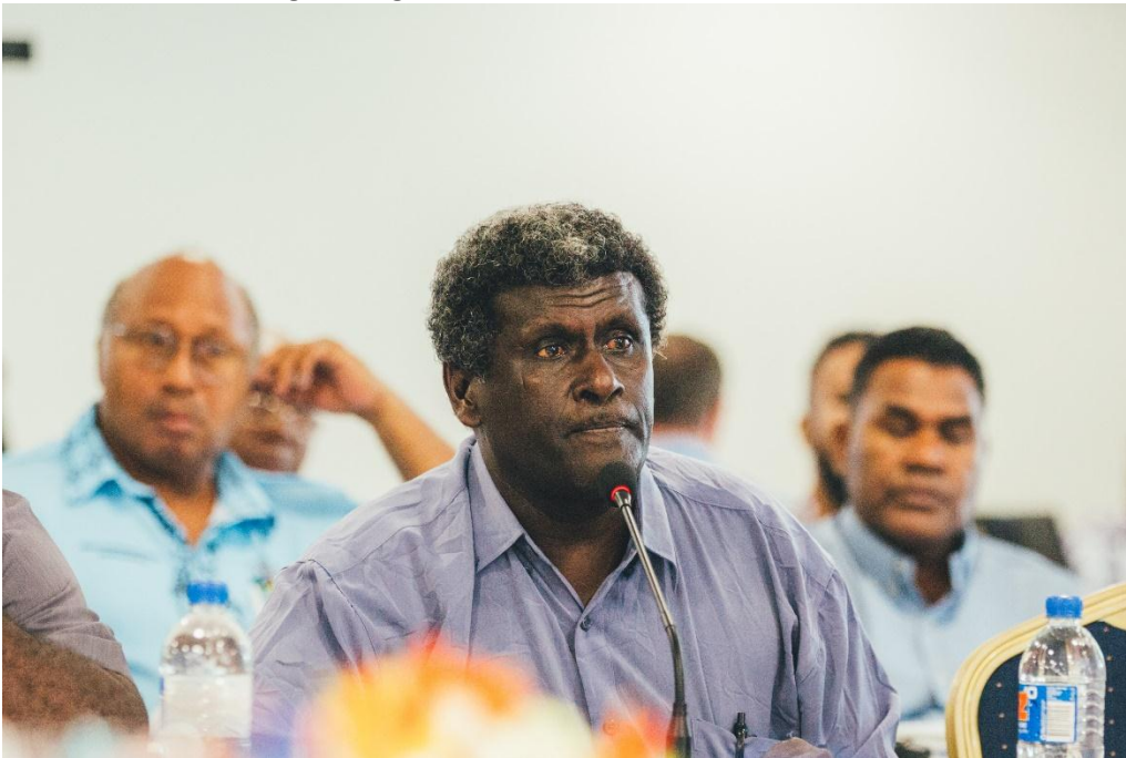
Honourable Molley Lopoto, Deputy Premier, Western Province.