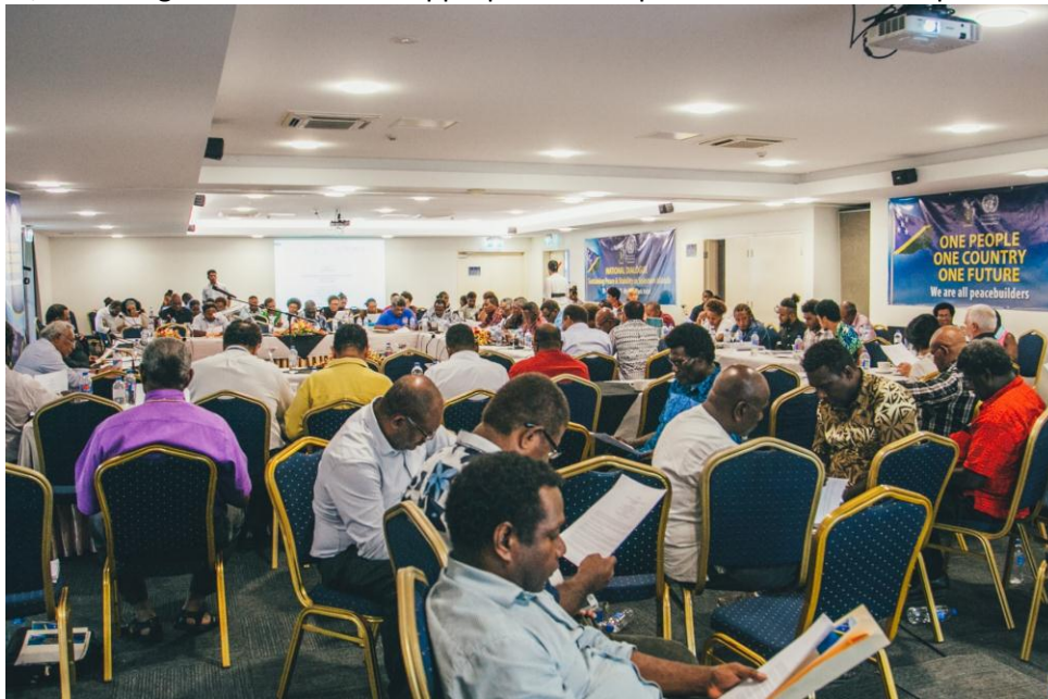
National dialogue participants reviewing and providing feedback on the draft communique

75. At the end of the session, participants unanimously agreed on the key content of the national dialogue communique with the following themes: Sustaining Peace – Sustaining Development; Rural Development; Leadership; Inclusive governance; Women empowerment; Youth empowerment; Land reform and natural resources; Security and the Transition; Education; Reconciliation and peace building. This commitment is a significant step forward as participants pledged to offer their time, resources, knowledge and skills where appropriate to implement the communique.