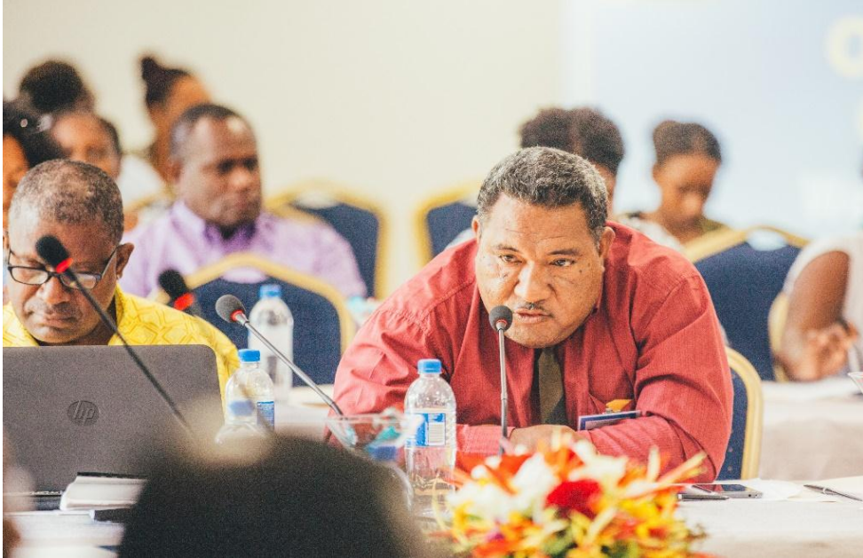
Honourable Collin Singamoana, Premier Renbel Province making his presentation.

companies are operating. He also called on government to deal fairly with all province in Solomon Islands. There are some requests by the province that were not accepted by the national government. Premier Singamoana believed that tensions were caused by government no listening to its people. He called for all leaders to listen to the people to ensure peace and stability is sustained.