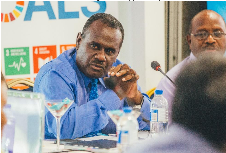
Honourable Jeremiah Manele, (left) Leader of the Opposition group in Parliament.

Honourable Manele acknowledged and supported the calls made by the provincial premiers. He said that the link between peace and development is obvious and cannot be separated. There is a need to address long-term peacebuilding by investing in children and in infrastructure. There were similarities in challenges faced by provinces. Sustaining peace is everybody's business to ensure long term stability and sustainability of the country.