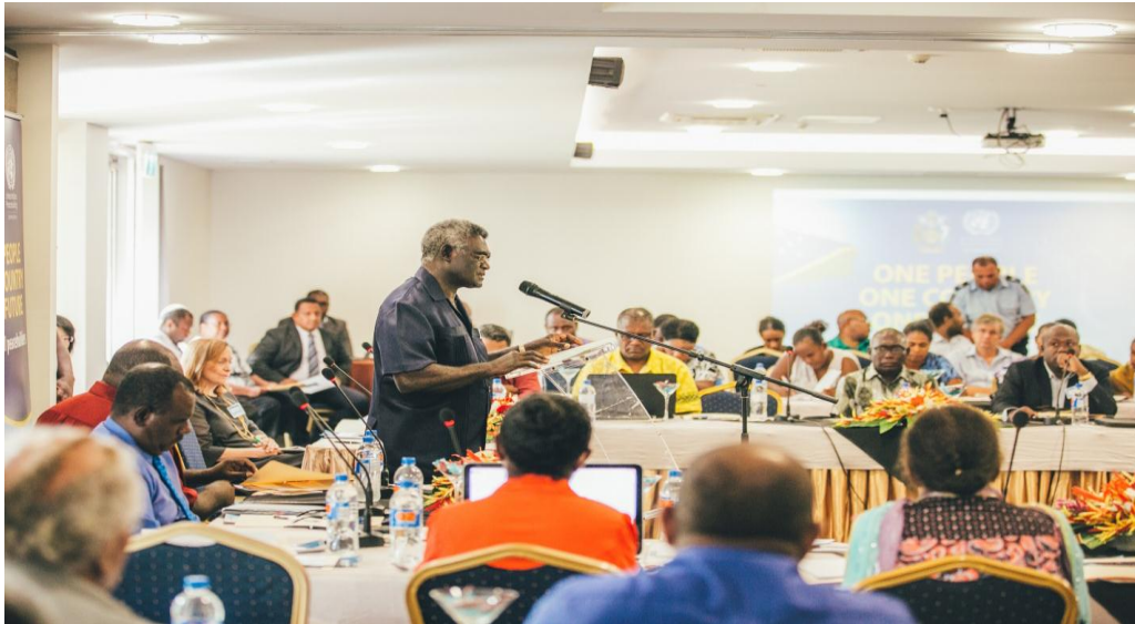
Honourable Manasseh Sogavare, Prime Minister, delivered the key note address

education and health; and (iii) the frequency of natural disasters that continuously undermined development progress. In terms of going forward, prime minister Sogavare noted that: “One thing that is common to all of us, even to all of us in Cabinet and in our Parliament; we will never allow our country to slide back to our darkest days of ethnic conflict as we have experienced from 1998-2003.” He called on all government ministries and development partners to closely examine their development policies to ensure they promote peace building and unity rather than division.